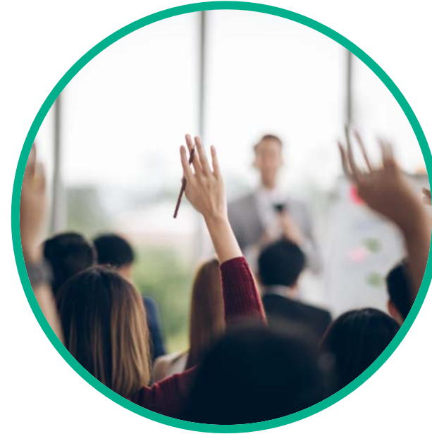
Nonprofit Member Solutions