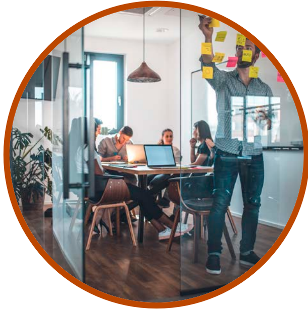
Back Office Support Services